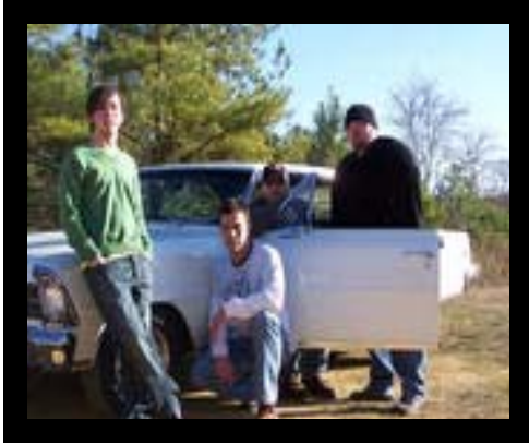
One Shot Down