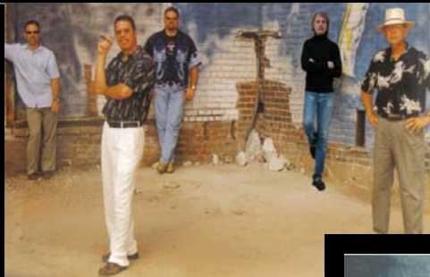
No Big Deal